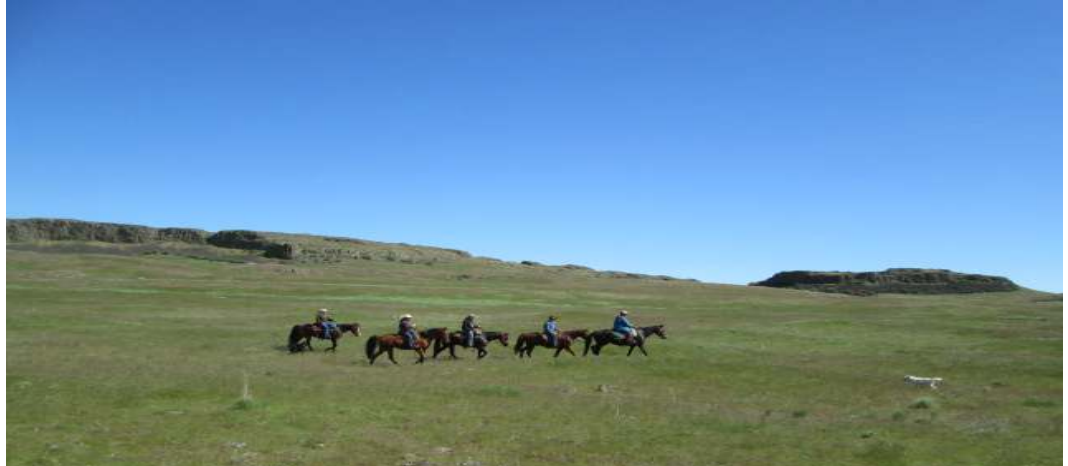
Photo below: Group of riders cover ground on Escure Ranch Ride. Photo at right shows riders crossing creek on Saturday ride. Some 25 people attended the 2-day event.

The trail boss announced that the fire would be going and the coffee would be hot by 6 and we would hit the trail by 9. Despite some grumbling everyone stuck to the schedule and we were out of camp on time. We stuck to the 11 mile designated trail on Saturday and were back to camp in plenty of time for afternoon naps and refreshments. The Sunday ride to Towell Falls is only about an hour each way so it leaves time for a later start with plenty of time to pack up and head home after the ride. In addition it offers the opportunity to take a more challenging cross country route home with some steep, rocky descents, a little narrow hillside trail, a couple creek crossings and, for one person, an unexpected dip in a very cold creek.